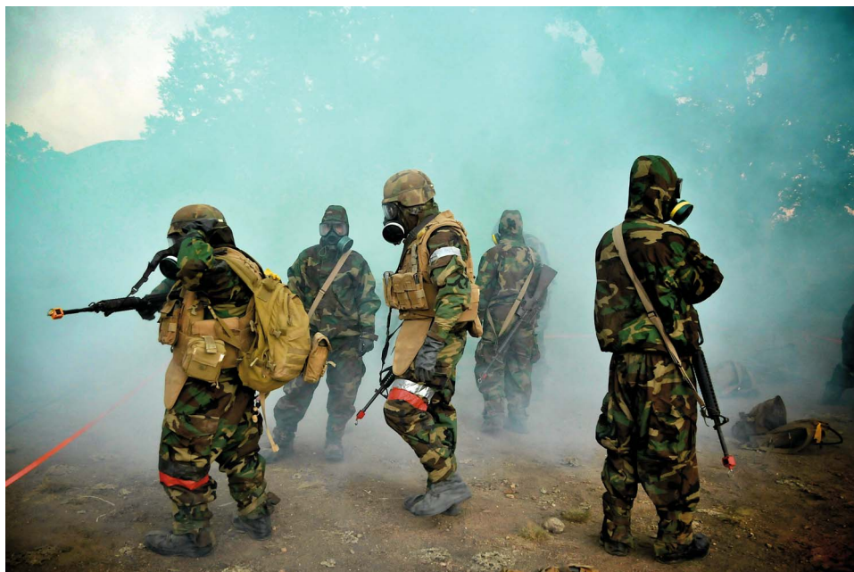
Figure 1 US Navy Seabees in full mission-oriented protective posture gear training with smoke grenades and tear gas. Public domain image. Photograph credit: Photo by Chief Mass Communication Specialist Michael B. Watkins, US Navy.

a boiling point of 244–245°C, and at 20°C it has a low vapour pressure of 5.4 \times 10^{-3} mm Hg. 10 CN is practically insoluble in water, though it is freely soluble in ethanol, ether and benzene. CN was developed at the end of the First World War, although it was not used during combat. 11 Following the First World War, it was widely used both by the military and various law enforcement agencies until the development of the more potent and less toxic incapacitant, CS, which became available in 1959. 1 Table 1 details a brief comparison of the toxicity of all three agents.