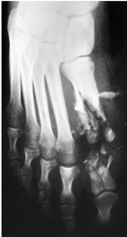
Fig 2. Shattered first metatarsal fragmentation injury.

casualties had been evacuated from the site. Four of these casualties arrived at Groote Schuur Hospital within one hour.