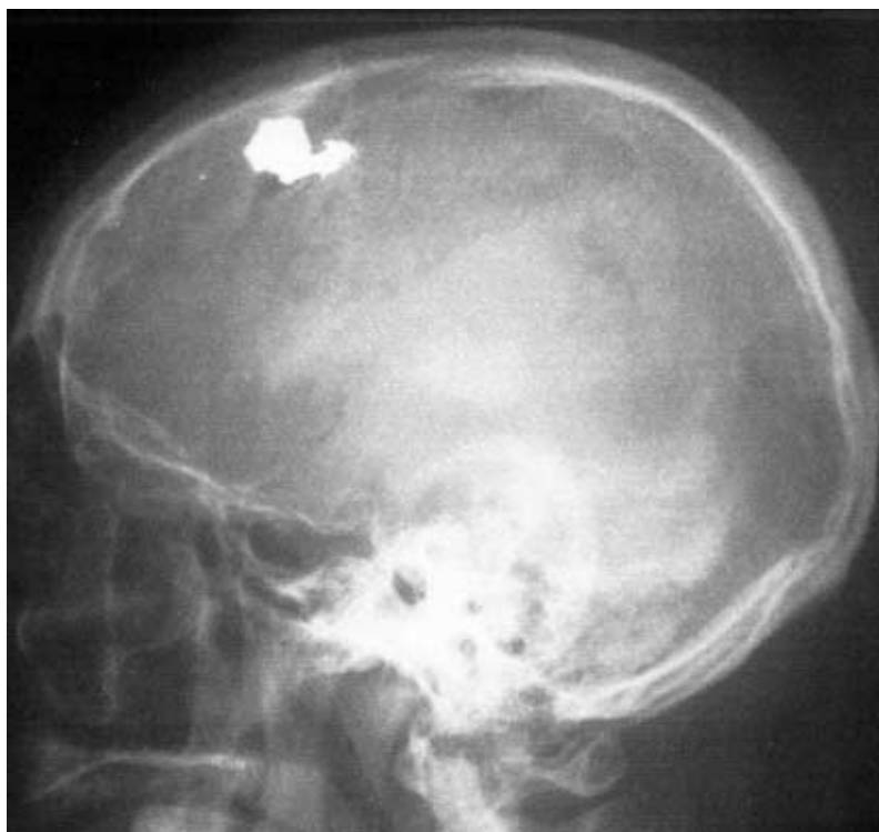
Fig 4. Shrapnel injury to skull.

He had no neurological deficits. The patient was discharged from hospital 2 days postoperatively under police escort.