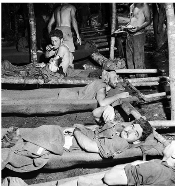
Figure 1 ‘Australian infantry, wounded while attacking Oivi, are treated afterwards at an advanced dressing station. November 1942.’

A decision was therefore made to operate for 18-hour periods only, and then by default, men requiring surgery were deliberately left as there was no alternative; this allowed the team to continue to function for several months. In December of the campaign, two surgeons arrived at Soputa and worked in two 12-hour shifts, which enabled every wounded man to be